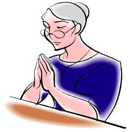
Be Faithful in Prayer.

5. What title does Luke give her in verse 36? A _____. We are not to imagine that a "prophetess" was an office she fulfilled. Most likely, it meant that she had a reputation as a gifted teacher of other women and a faithful encourager of her fellow worshipers in the temple. When she spoke, it was about the Word of God. She had spent many years hiding God's Word in her heart. How old was she _____ yrs. V.37